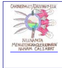
Caninermiut/Qaluyaat-Illu Nunamta Menvitengnaqlerkaanun Nunam Caliarit

The consortium consists of 7 villages along the coast and inland. They are in order Chefornak, Kipnuk, Newtok, Nightmute, Toksook Bay, Tununak, and Umkumiut.