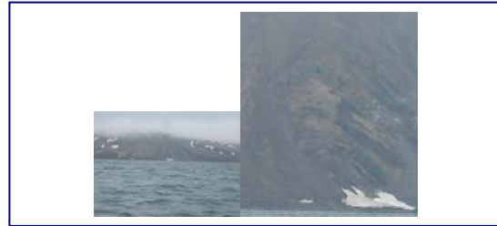
during halibut fishing in May 2008.

Since forming the NIC, and with the teleconference every Friday. NIC meets and discusses what needs to be taken care of, what each village is doing, and what steps are taken care of for individual problems. One of the successes that NIC created was passing an ordinance for all NIC regions. The banning of Styrofoam cups, and bowls used by school district. The NIC had two elders present for each NIC villages during the conference held in