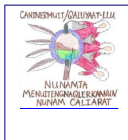
Caninermiut/Qaluyaat-Illu Nunamta Menuitengnaqlerkaanun Nunam Caliarit

The consortium consists of 7 villages along the coast and inland. They are in order Chefornak, Kipnuk, Newtok, Nightmute, Toksook Bay, Tununak, and Umkumiut.