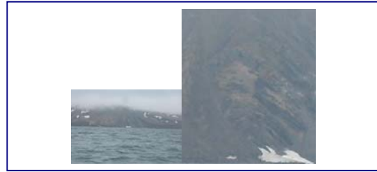
during halibut fishing in May 2008.

Since forming the NIC, and with the teleconference every Friday. NIC meets and discusses what needs to be taken care of, what each village is doing, and what steps are taken care of for individual problems. One of the successes that NIC created was passing an ordinance for all NIC regions. The banning of Styrofoam cups, and bowls used by school district. The NIC had two elders present for each NIC villages during the conference held in