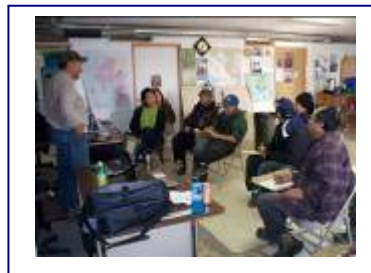
Caninermiut/Qaluyaat-Illu ArcGIS training in Tununak

Nearly a decade ago, EPA initiated a program to clean up brownfields. The program focused primarily on properties in urban blighted areas and was designed to empower states, communities, and others with economic redevelopment interests to assess, safely clean up, and sustainably reuse brownfields, as well as to prevent the creation of new brownfields. As the program has developed, rural land and properties are increasingly eligible for assistance, with reuse for fish and wildlife habitat, subsistence, greenspace, or recreational uses. More details are available on EPA's website about the formal definition of a brownfield site for the purposes of determining eligibility for federal funding, and what kinds of sites are included or excluded in the definition.